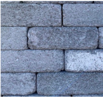
Waterloo 321 AT