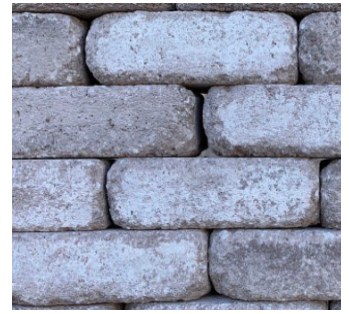
Tacoma 373 AT