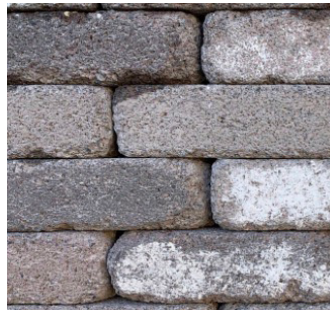
San Marcos 355 AT