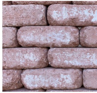
Santa Fe 363 AT